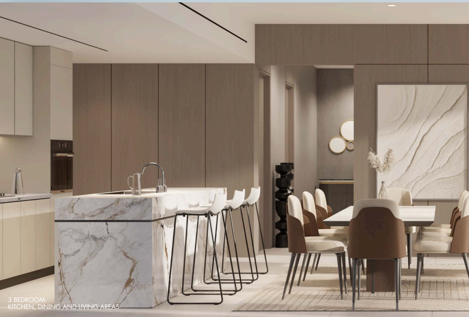
3 BEDROOM KITCHEN, DINING AND LIVING AREAS